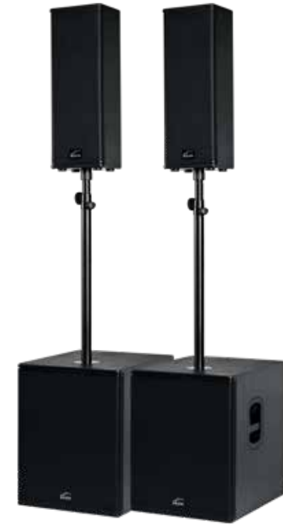
TWIN ARRAY PLUS 2 x aart T 28 A 2 x SUB 15 A