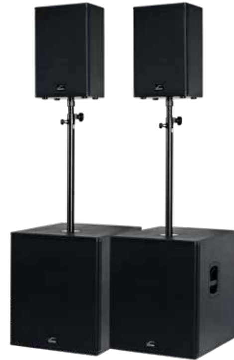
aart S TWO 2 x aart T 12 A 2 x SUB 18 A

SOLTON ACOUSTIC GmbH & Co. KG / Gewerbeing 51 / 94060 Pocking / Germany / Phone +49 (0)9531 913880 / Fax +49 (0)9531 978507 / info@solton-acoustic.de / solton-acoustic.com Für Druckfehler keine Haftung / For printers error no liability / Ausgabe 2018 / Issue 2018