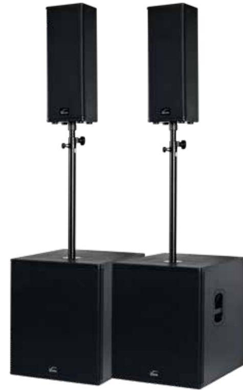
TWIN ARRAY MAXI 2 x aart T 28 A 2 x SUB 18 A