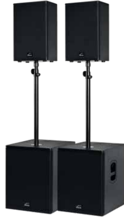
aart S ONE 2 x aart T 12 A 2 x SUB 15 A