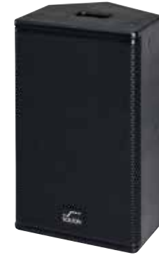
aart T 10 A