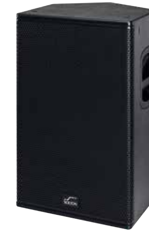
aart T 15 A