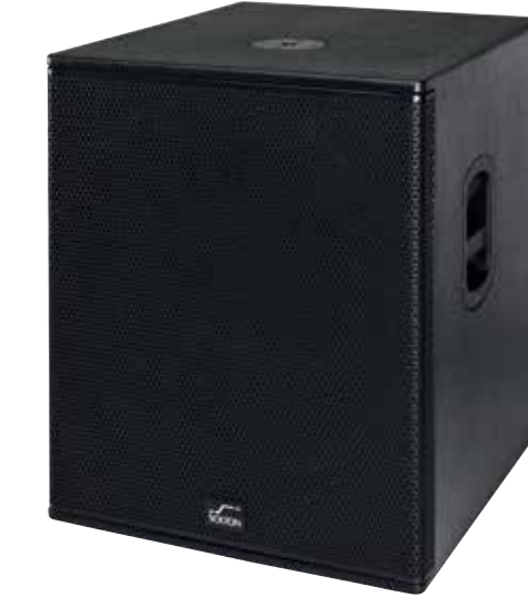
SUB 18 A