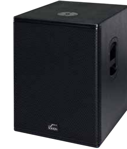
SUB 15 A