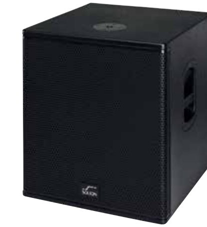
aart SUB 315