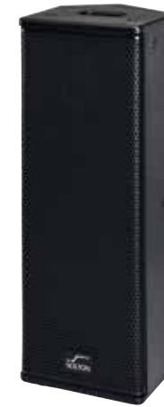
aart T 28 A