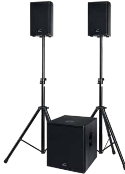
ACT SAT 2 x T8 1 x aart 315

High-class performance in a compact and multifunctional design Class D bi-amped power module Sophisticated high-sensitivity transducers Rotatable high-frequency horn Dual-band limiters for independently stable performance 4 DSP sound presets Two inputs (XLR / 6.3, one with MIC/LINE switch and with high-resolution microphone pre-amplifiers (in MIC mode) Line / Mix OUT switchable Coverage pattern 90° x 60° Monitor operation possible Rigging inserts, U-mount bracket optional