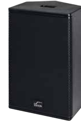
aart T 12 A